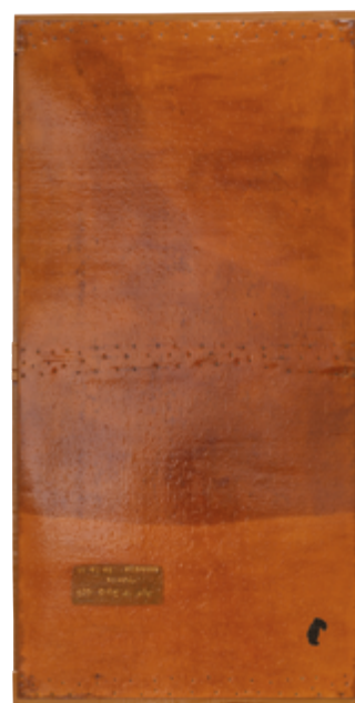
Antón Lamazares. Ay Ay Ay Aiii corazón solo vives un día, (1987/ 2014).

Exhibition opening hours: 9 & 10.05, 10am — 8pm