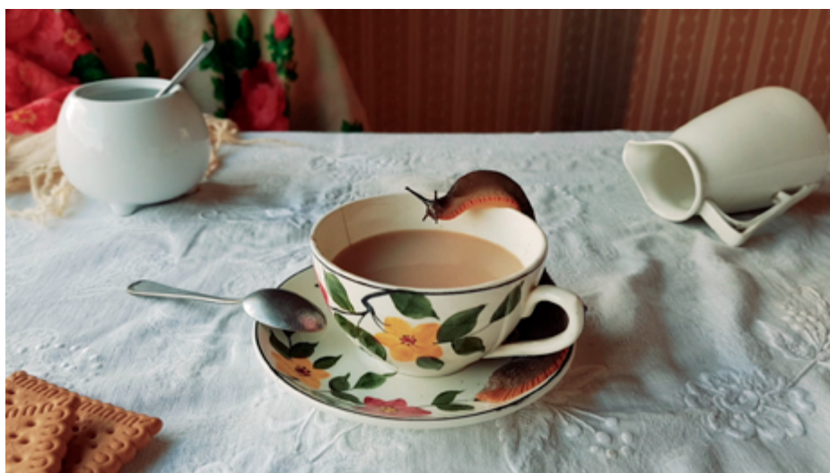
Greta Alfaro: Solitude, 2020. Single-channel video, HD, colour, sound, 16:9, 24 min.

Limited capacity. RSVP: suburbiacontemporary@gmail.com