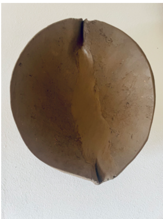
Anna Dot: Libacions, 2025. Courtesy of Palmadotze.

Meeting point: 10:30 am, corner between Centre d'Art Santa Mònica and c/ del Portal de Santa Madrona. Return: 2 pm