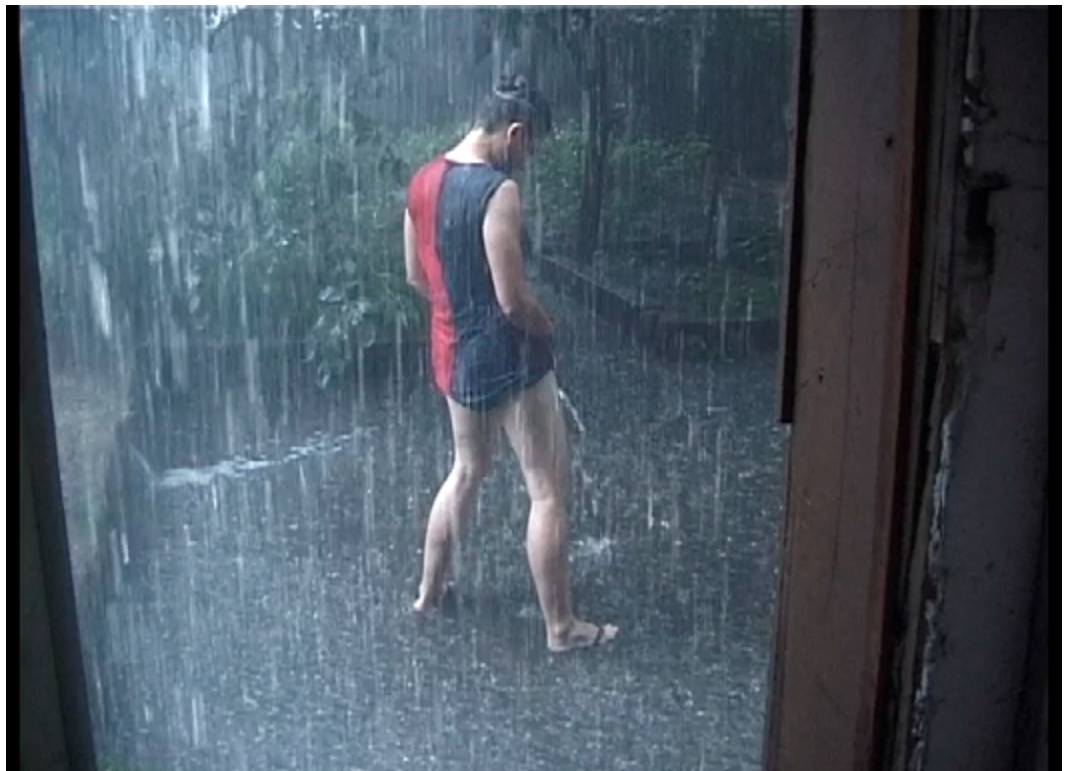
Itziar Okariz: Mear bajo la lluvia, 2019.

To comment on this work by the artist represented by the gallery will allow us to expose and discuss the role of the different actors within the context of art. Where do we place ourselves? What are our motivations? What role do we want to play? How far does our commitment reach?