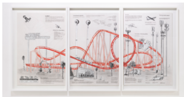
Joan Pallé: The 4th industrial revolution roller coaster, 2022.