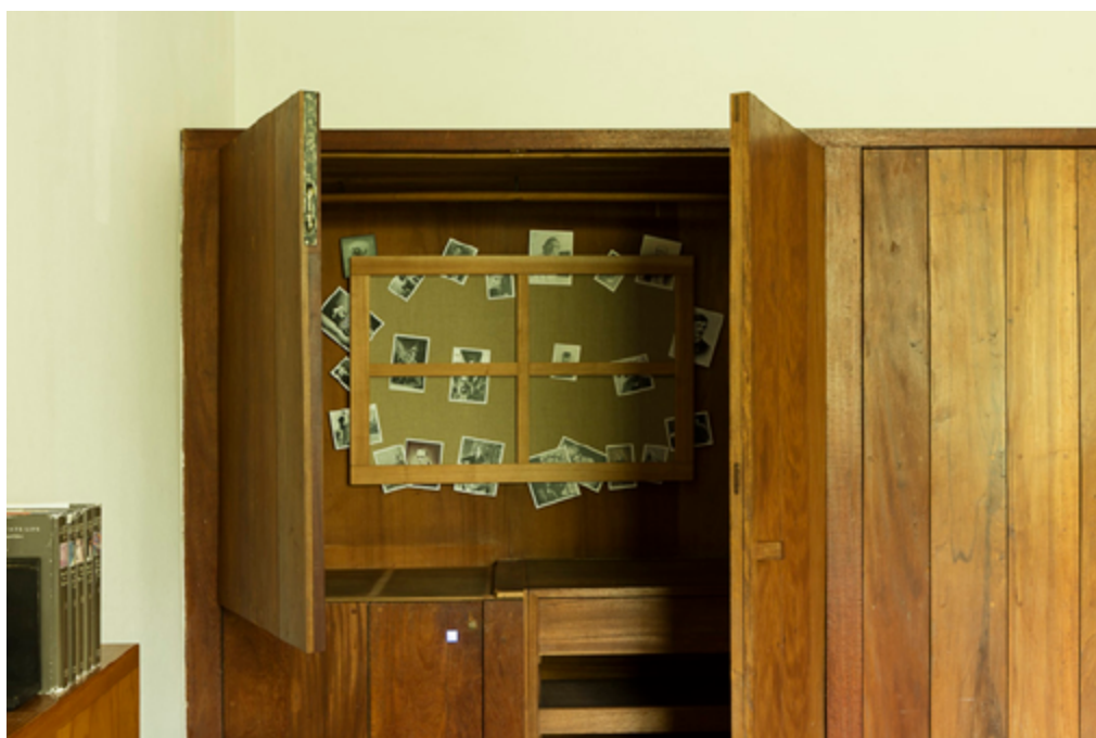
Iñaki Bonillas: Secretos: Men I Love , 2016.

Conversation between the artist and the collector.