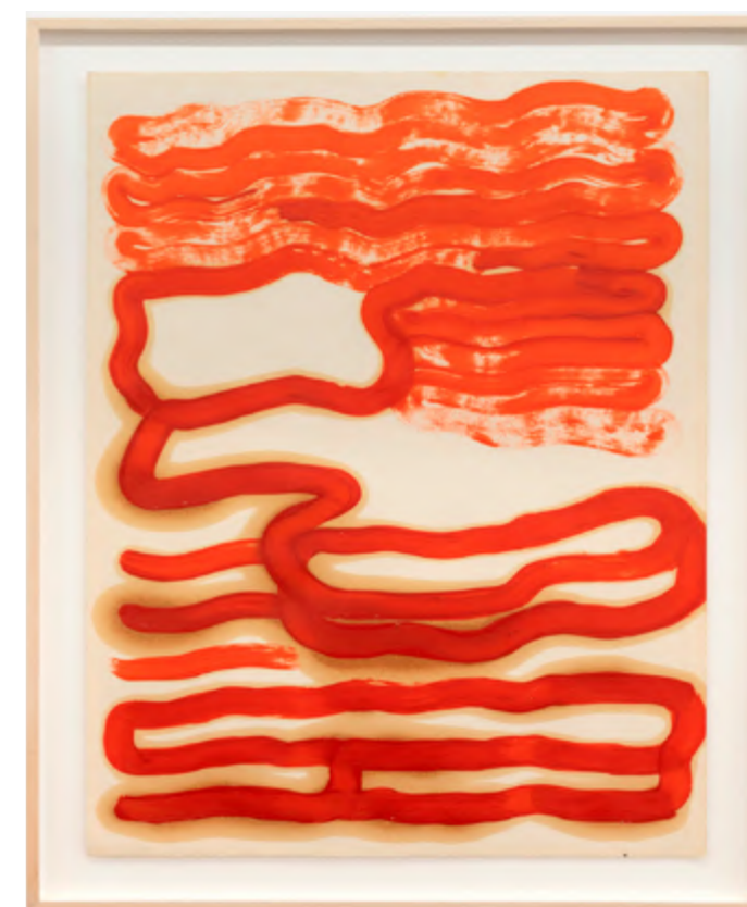
SIRCLE COLLECTION Ana Mas Projects Berta Cáccamo: Sin Título , 2012 Oil on paper 70 × 50 cm