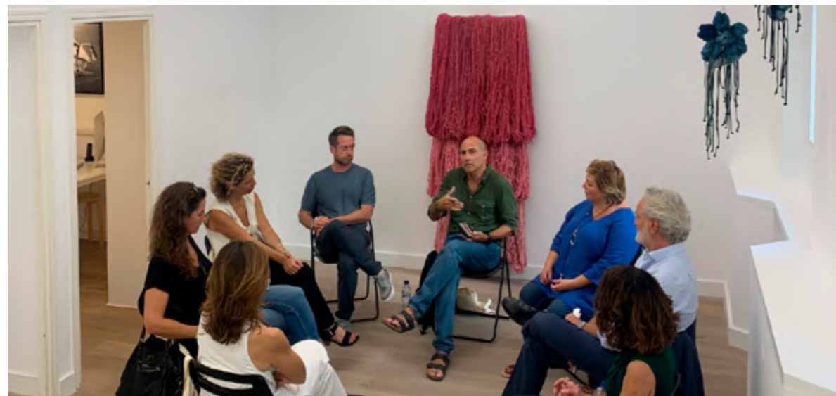
Private is the new public...? at Zielinsky.